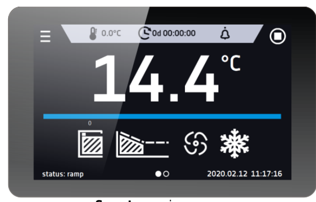
Smart - preview screen