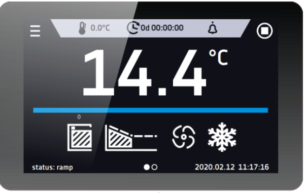
Smart - preview screen